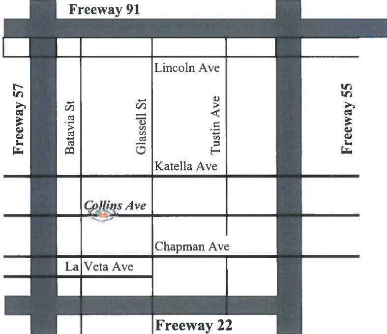
Map (Not to Scale)